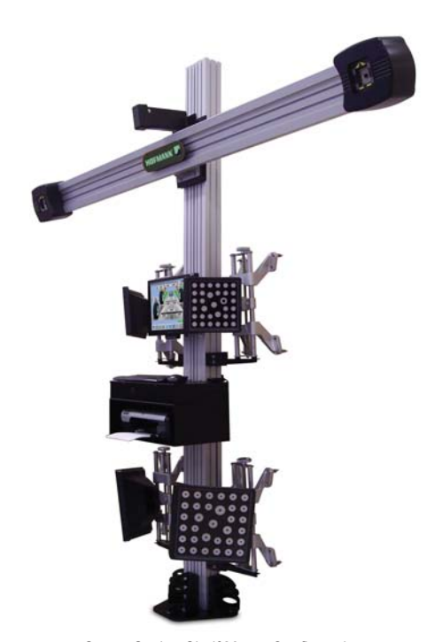
Space-Saving Shelf Mount Configuration Shown with Optional Fixed-Height Camera Support Extended and Electronic-Tilt Camera System (FHCSE/ETCS Kit)