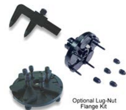
Optional Lug-Nut Flange Kit

Essential for the more precise balancing, this adjustable multi-position flange plate kit includes centering pin adapters to fit most import and domestic car and light truck lug-bolt patterns. The specially designed lug-bolt adaptors balance wheels far more accurately than a cone can do by itself, resulting in a smooth, vibration free drive. Includes flange plate kit and measuring caliper.