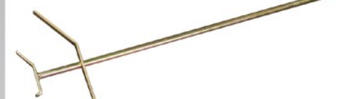
Dell Color Printer