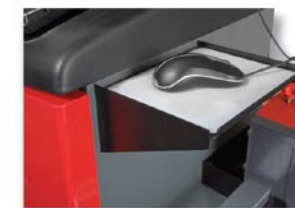
Convenient Mouse Tray