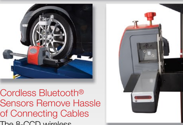
Cordless Bluetooth® Sensors Remove Hassle of Connecting Cables

The 8-CCD wireless measuring sensor system consists of 8-CCD cameras which are fitted within the horizontal sensors (toe) and vertical sensors (camber and angle of steering inclination). As shown above, the 8 sensors form an enclosed 360° measurement field.