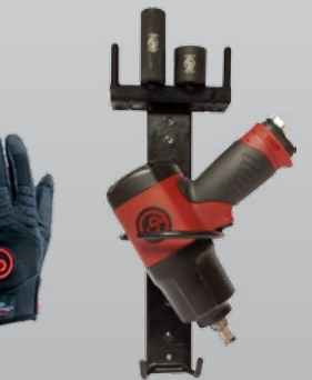
Magnetic tool holder for convenient workstation organization.